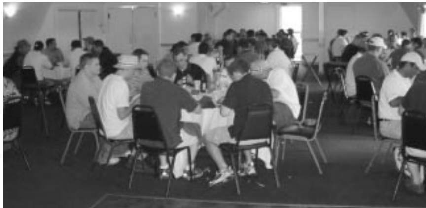
Following the EBA Open, golfers enjoyed dinner at Pine Ridge.

For complete results and pictures, see the EBA Open page on the alumni web site... http://jmmelvin.ne.client2.attbi.com:1856/oxe/alumni/golf -> results -> 2002