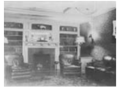
WPI Theta Chi, 1930s livingroom