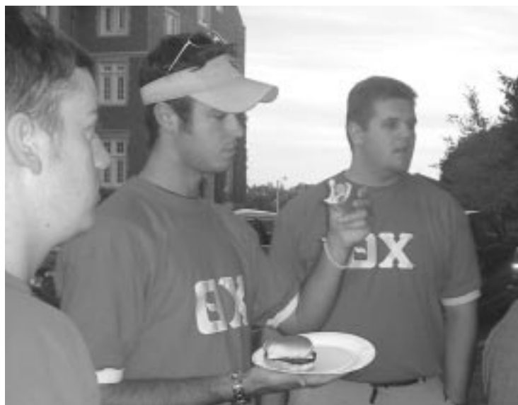
Homecoming 2002 cookout on the quad.