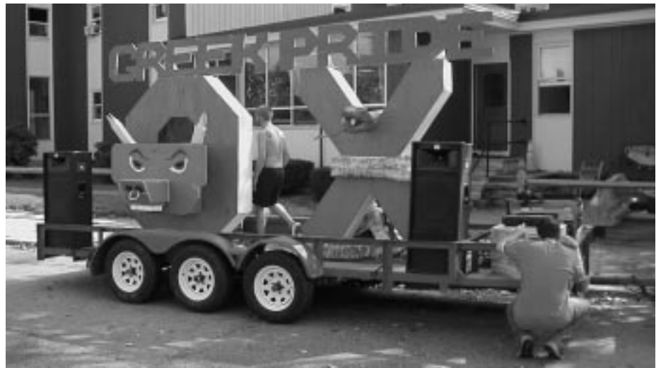
First-prize Homecoming float secures Theta Chi Greek Week victory!

At Homecoming 2002, we rejuvenated our presence on the quad with a very successful Theta Chi cookout. The brothers secured an excellent location, right on the corner in front of Morgan Hall. Several Theta Chi alumni congregated at the cookout and enjoyed some of the largest burgers I have ever seen. We also enjoyed watching our chapter's excellent float win first prize, helping to secure a first-place