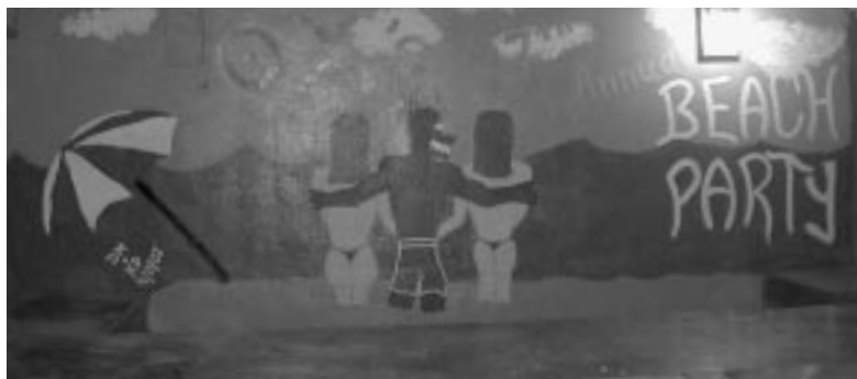
Above: Party room mural for Beach Party. Right: New second-floor hallway.